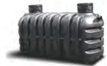
Vento Septic tanks