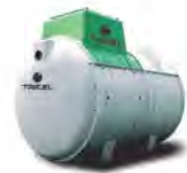
Rainwater harvesting systems