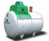
Novo Domestic wastewater treatment plants